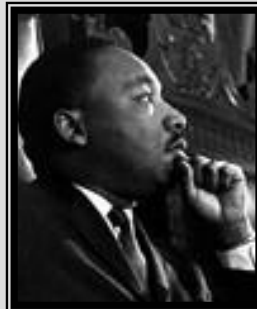
January 15, 1929 - April 4, 1968