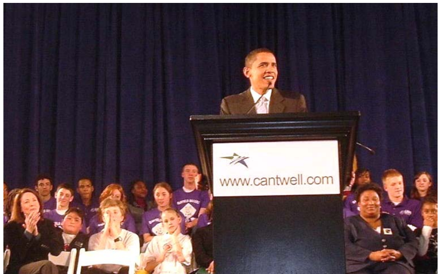
U.S. Senator Barack Obama of Illinois enlightens the standing room only crowd at Garfield High School on March 18th. U.S. Senator Maria Cantwell of Washington is left, front row applauding his remarks.