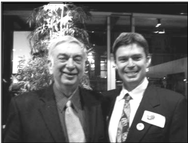
Governor Mike Lowry and Spirit of Washington Dinner Train Owner, and Honors Banquet Sponsor, share a light moment.

www.kcdems.org / kingcountymocrats@msn.com